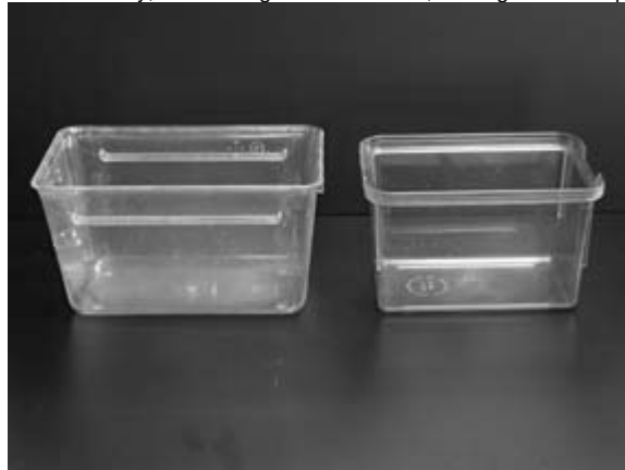
Figure 1. The container on the left is a polycarbonate Nalgene animal cage (24x14x13 cm). It has a volume of approximately 2 liters. The container on the right is a Thoren crossing cage and holds approximately 1 liter. Both containers work well for paramecia and any similar containers should be adequate.

If 1 liter cages are too large for the daily needs of the facility, smaller cages can be made, as long as the recipe is adjusting accordingly.