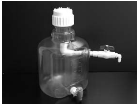
Figure 3. The paramecium collector is made from a carboy, with a spigot at the bottom, and various plumbing fixtures (Fig. 4). A 16 liter carboy is recommended for larger facilities, although an 8 liter carboy will work well for those needing to make only small amounts of paramecia.