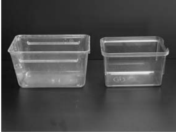
Figure 1. The container on the left is a polycarbonate Nalgene animal cage (24x14x13 cm). It has a volume of approximately 2 liters. The container on the right is a Thoren crossing cage and holds approximately 1 liter. Both containers work well for paramecia and any similar containers should be adequate.

If 1 liter cages are too large for the daily needs of the facility, smaller cages can be made, as long as the recipe is adjusting accordingly.