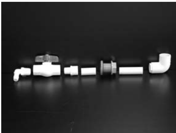
Figure 4. The top drain is made using (from left to right) 90° tubing adapter ( \frac{1}{2} " i.d., \frac{1}{2} " threaded), \frac{1}{2} " PVC ball valve, \frac{1}{2} " male adapter, a 2" length of \frac{1}{2} " PVC pipe, \frac{1}{2} " bulk head fitting, \frac{1}{2} " PVC pipe, \frac{1}{2} " 90° elbow. The length of the second piece of PVC pipe is determined by what size container you are using. The elbow needs to sit directly below the center of the opening in the carboy. Cut the PVC pipe to accommodate this. It is better to press fit the pieces together as opposed to PVC gluing them. This makes dismantling easier when the unit needs cleaning.