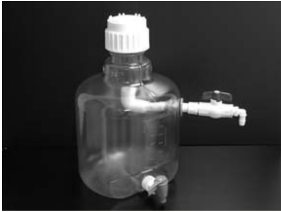
Figure 3. The paramecium collector is made from a carboy, with a spigot at the bottom, and various plumbing fixtures (Fig. 4). A 16 liter carboy is recommended for larger facilities, although an 8 liter carboy will work well for those needing to make only small amounts of paramecia.