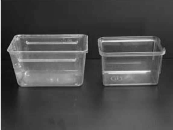
Figure 1. The container on the left is a polycarbonate Nalgene animal cage (24x14x13 cm). It has a volume of approximately 2 liters. The container on the right is a Thoren crossing cage and holds approximately 1 liter. Both containers work well for paramecia and any similar containers should be adequate.

If 1 liter cages are too large for the daily needs of the facility, smaller cages can be made, as long as the recipe is adjusting accordingly.